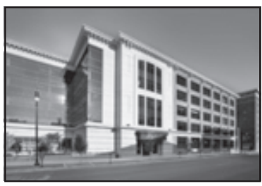
The Grand Rapids campus, opened in 2003.